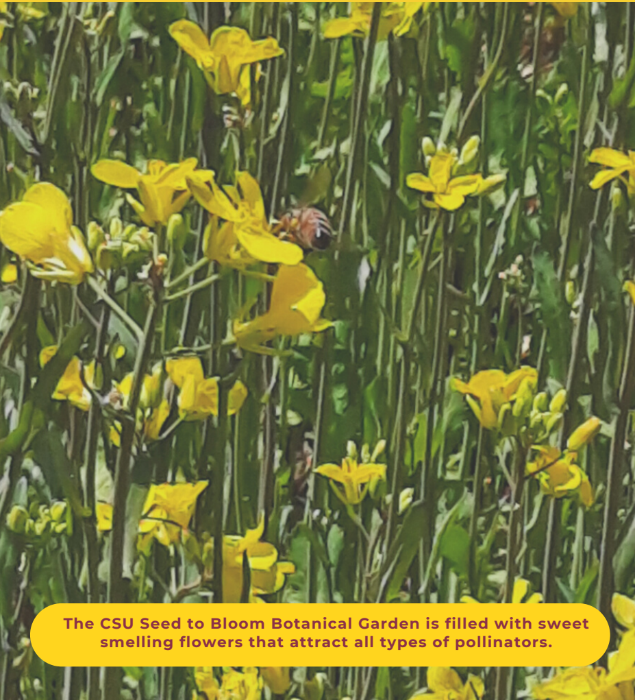
The CSU Seed to Bloom Botanical Garden is filled with sweet smelling flowers that attract all types of pollinators.

COVER: Central State University John W. Garland College of Engineering, Science, Technology, and Agriculture (JWGCESTA) receives part of a $10 million grant to grow the next generation of agricultural professionals