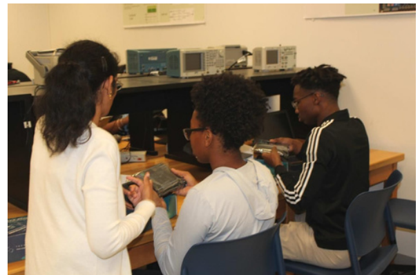
Students participating in labs at Intel Summer Internship