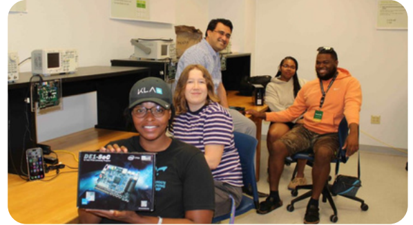
Interns show off FPGA boards